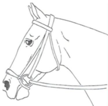
3) Dropped noseband