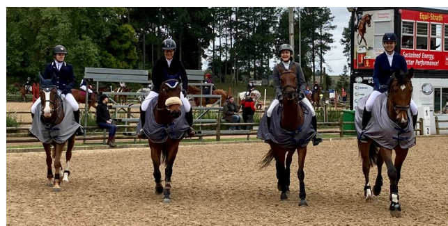
Adult 95 Team