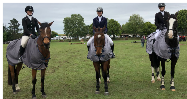
Adult Open Team

https://live-scoring.eventingsa.co.za/selected.php?id=395