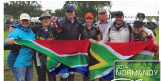
SA supporters at WEG

Follow AP Eventing on Facebook for more photos and videos from WEG!