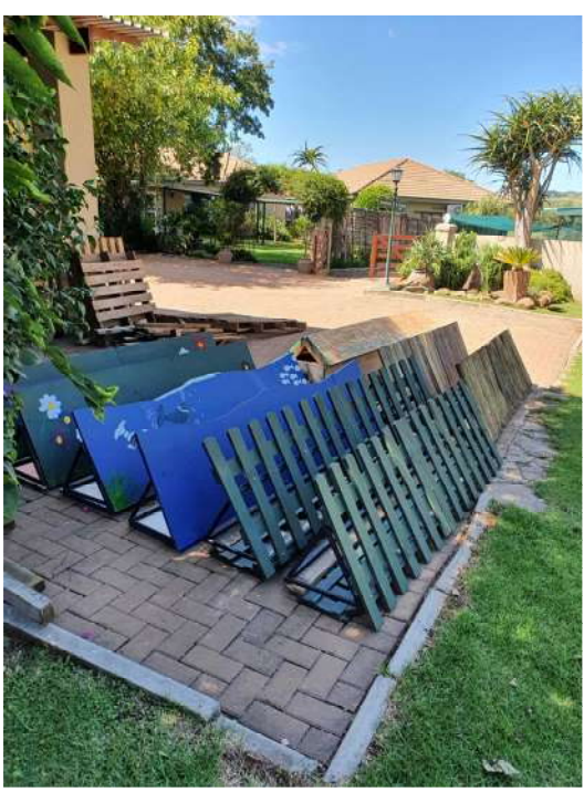
Frames - I have used RE Bar for the end triangles to give them strength and Square tube 2mm x 25mm and 2m in length. These are then welded as per diagram.

The challenge was to design and build a set of jumps that could be easily moved to multiple venues that are robust and will accommodate two height variations for two different courses. This method can be altered for a "Home" set of jumps where necessary. This set can be loaded on the back of a back of a bakkie or on one side of a two berth horse box.