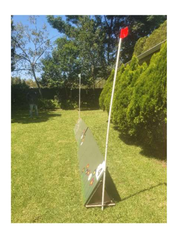
Jump 5 – Water jump – 4m in two section s

AS above for no 4 but the top gets curves on it to resemble waves and painted blue with lots of fish