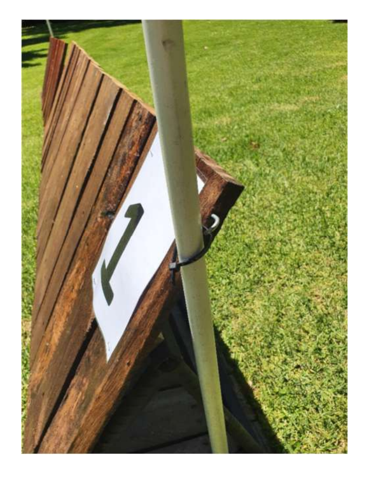
Jump 2 – Green Picket fences – 4m wide in two sections

Same as in 1 above I have attached horizontal planks onto the frames and then screwed the picket fences I purchased from my local hardware store. Painted green.