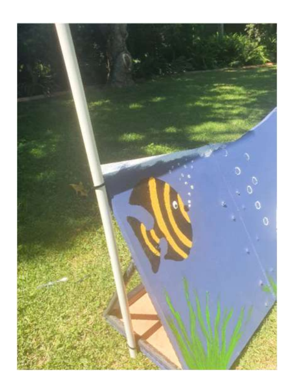
Jump 6 – Red House - one 2,4 m length

As with jump 3 above build frame with not poles but roof timber then clad with shutter board. Complete with red roof and white below including the base as this is the front for the 35cm jump.