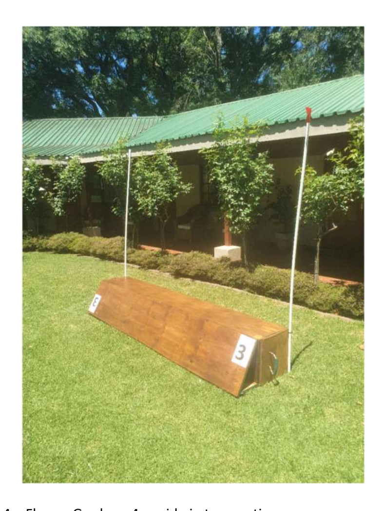
Jump 4 – Flower Garden - 4m wide in two sections

Using two metal frames clad with shutter board 35 \, \text{cm} \times 2 \, \text{m} on one side and 55 \, \text{cm} \times 2 \, \text{m} on the other using Tec screws. Paint green with lots of colourful flowers.